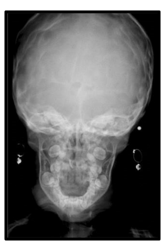
Fig. 6: Posterio-anterior view

anomalies such as polydactyl or syndactyl were noted. Provisional diagnosis for all these three cases was given as Crouzon syndrome. Comprehensive history of the family was taken to discover if any other members were affected. While in case 1 this was the first incidence in the family, cases 2 & 3 reported with a positive family history where Mother and her father were also known to have similar facial appearance. Differential diagnosis of Apert syndrome, Pfeiffer, Carpenter and Sayre-Chotzen syndrome which has similar clinical presentation were considered. Mutations in FGFR2 are observed in these conditions which lead to the development of synostosis of the cranial sutures and Symmetric syndactylus of the hands and feet generally involving the second, third and fourth