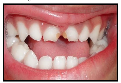
Fig. 3: Intra-oral view